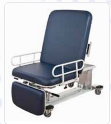
PG350 shown with upgrades