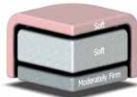
4" Comfort Foam ™ Superior comfort and support