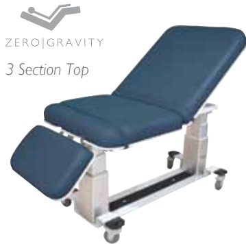
ZERO|GRAVITY 3 Section Top

The PG Series Exam Tables are designed for busy environments where they may need to be moved often to permit large pieces of equipment to occupy the same space. Casters come standard on this model, and several tops are available along with many options and accessories to support multiple procedures.