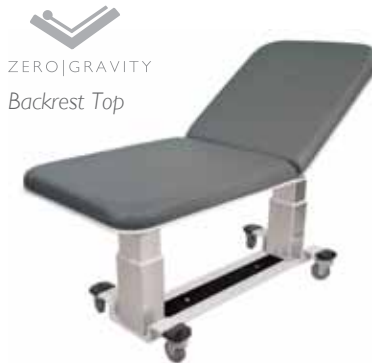
ZERO|GRAVITY Backrest Top