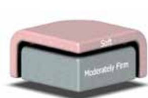
3" Comfort Foam ™ More comfort and support