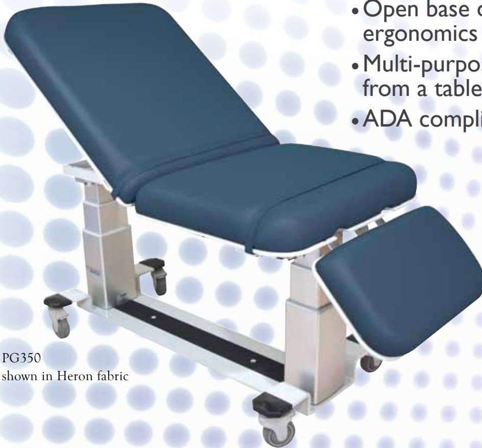
PG350 shown in Heron fabric