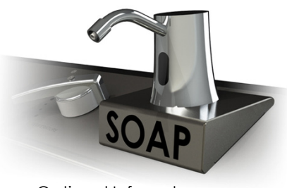
Optional Infrared Soap Dispenser