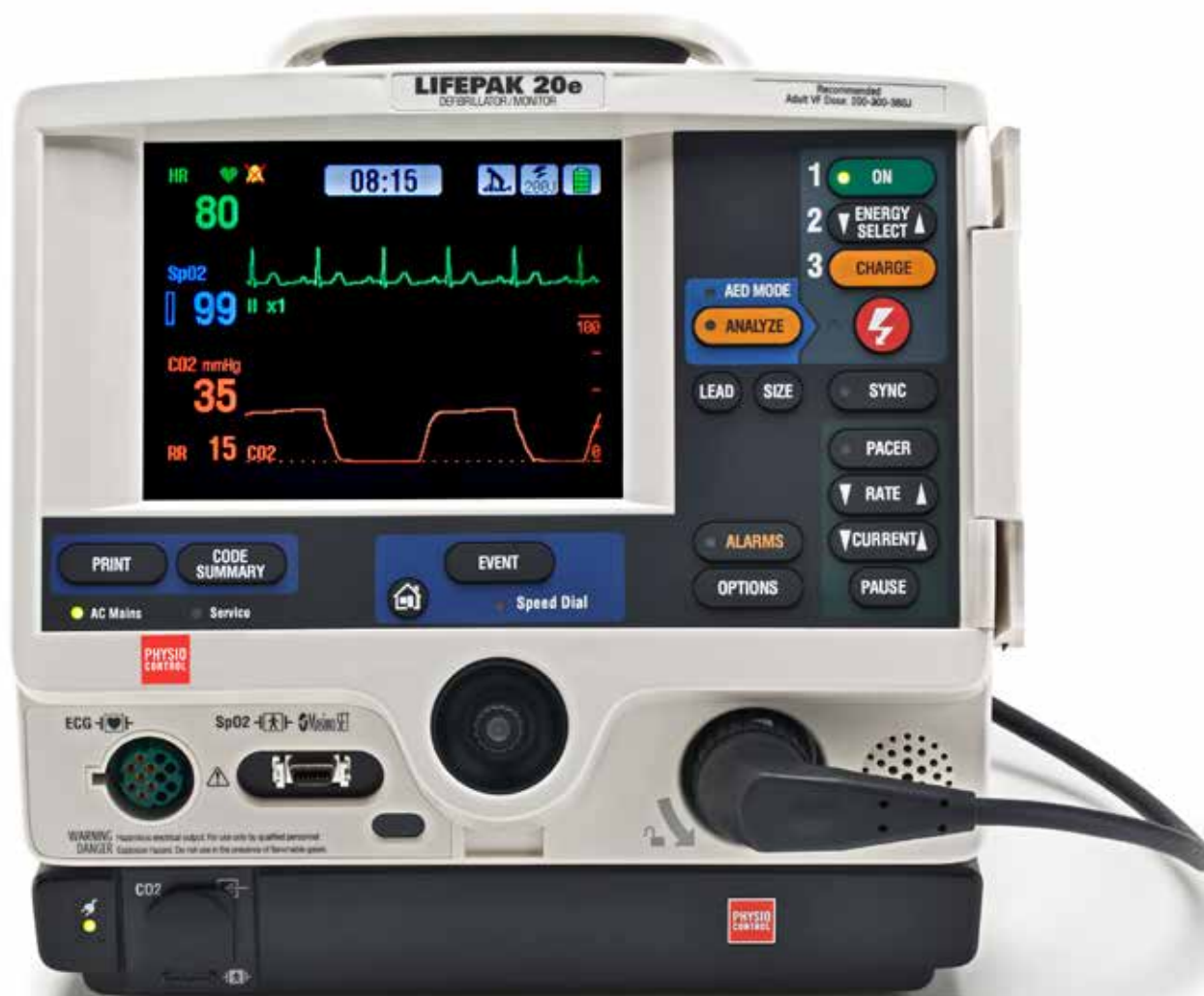
Manual Mode for ALS teams