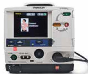
AED Mode for BLS teams