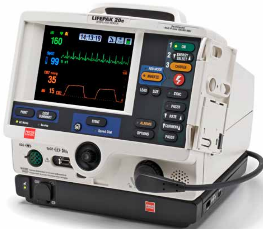
LIFEPAK ® 20e DEFIBRILLATOR/MONITOR with CodeManagement Module ®