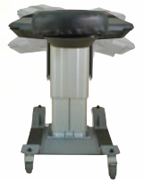
LATERAL TILT CFPM300