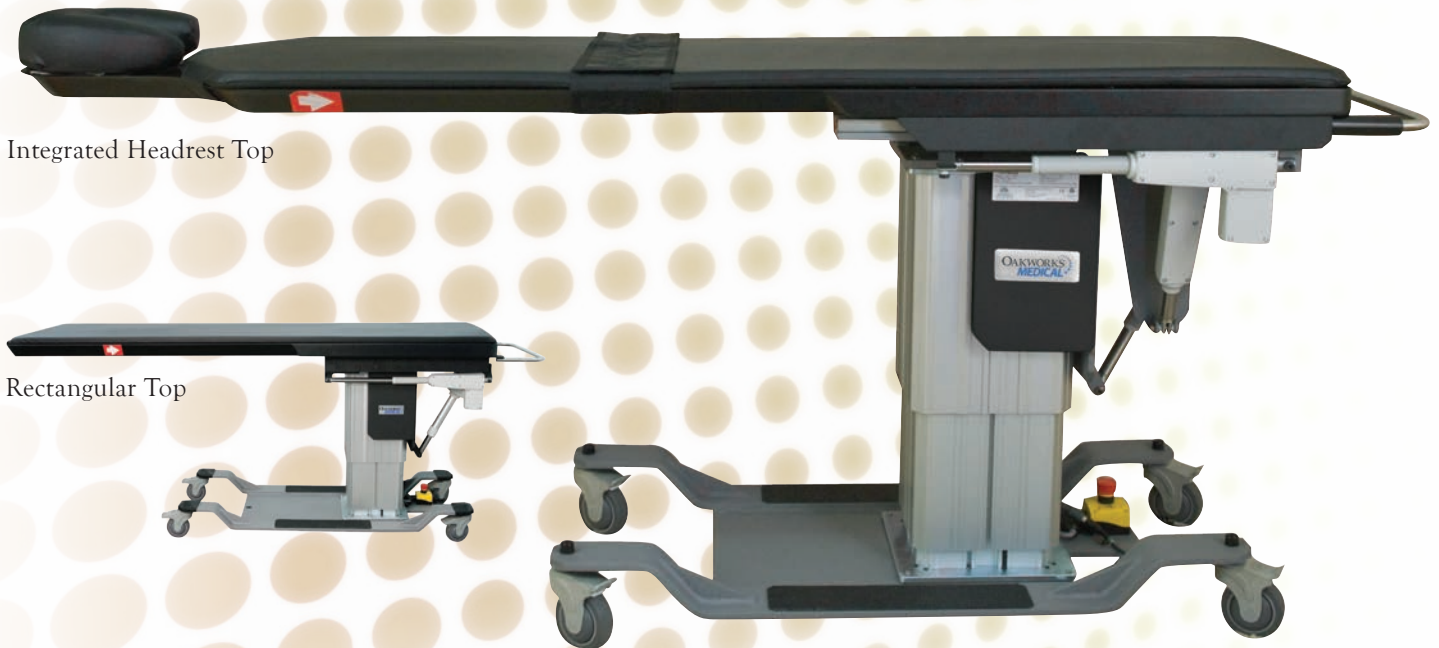
Integrated Headrest Top