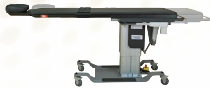
LONGITUDINAL TRAVEL CFPM301