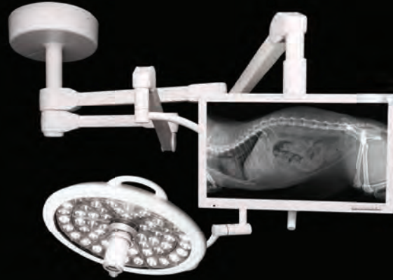
Dual Mount with One Light Head and One Monitor Arm

Providing dual lights for superior shadow control and intensity, or the option of one light and one video component (monitor or video camera). Without a doubt, an unparalleled value in the surgery market today.