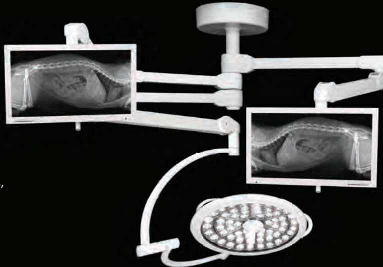
Triple Mount with One Light Head and Two Monitor Arms