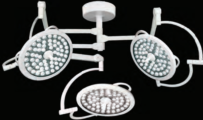
Triple Mount with Three Light Heads

The Triple Mount represents the ultimate flexibility in the surgery room. Configurations include three light heads, two light heads with video monitor arm, or video camera with two light heads. Complete surgery lighting and video capability with superb performance.