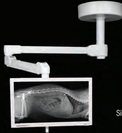
Single Mount with Monitor Arm

The single-light mounting system offers unsurpassed flexibility, exceptional illumination, and outstanding shadow control – even with just a single light head. This mounting can also support the high-definition video camera or monitor arm.