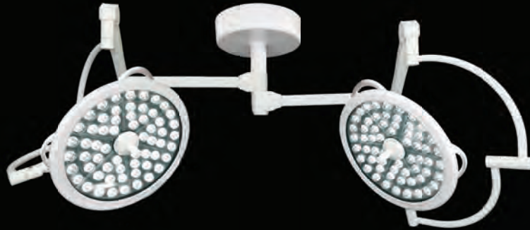
Dual Mount with Two Light Heads