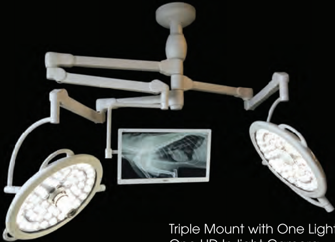
Triple Mount with One Light Head, One HD In-light Camera, and One Monitor Arm