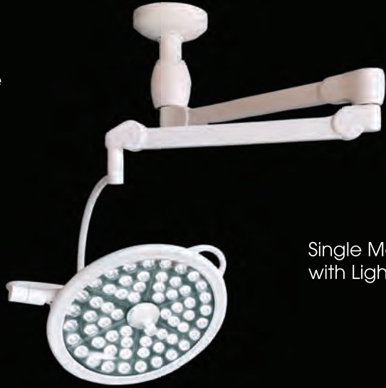
Single Mount with Light Head

Three lighting configurations and limitless possibilities. The VistOR MS comes in single, dual and triple mounts with one, two or three light or accessory options. Choose the best configuration to fit your operating rooms.