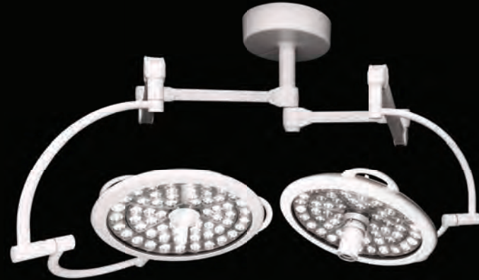
Dual Mount with One HD Video Camera and One Light Head