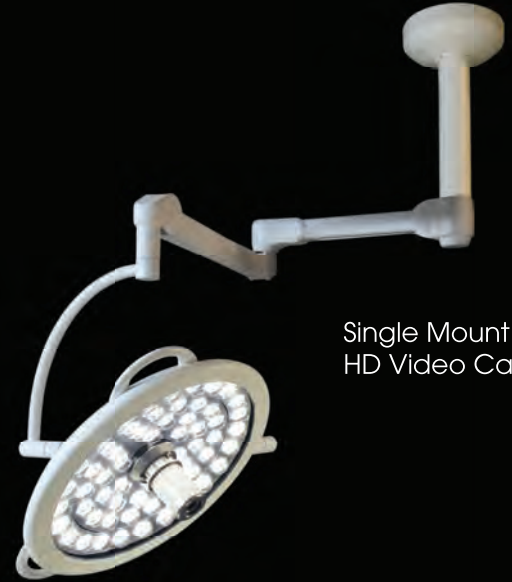
Single Mount with HD Video Camera